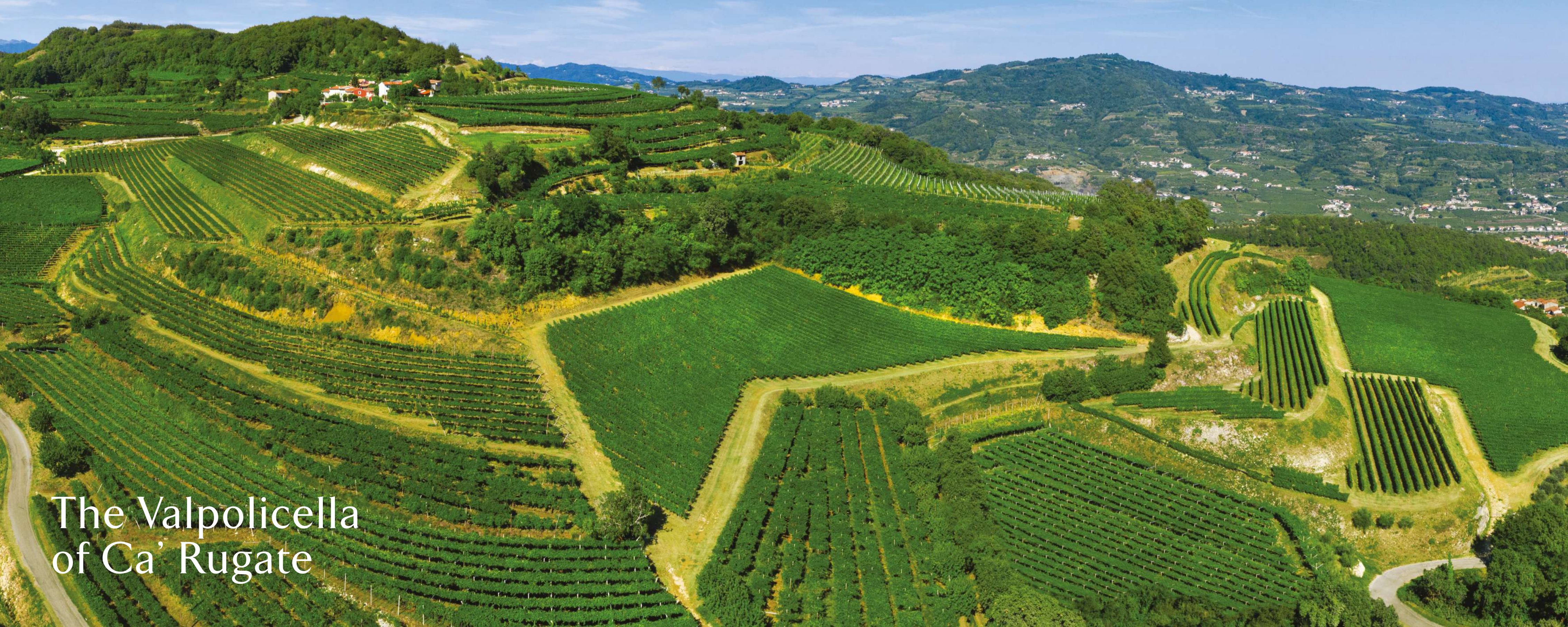
The Valpolicella of Ca' Rugate